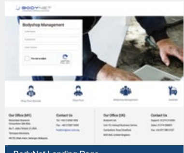
BodyNet Landing Page